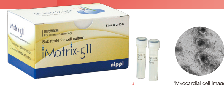
*Myocardial cell image